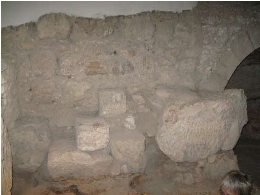
Original Stones of Caiaphas House

Could it be that Yeshua was held in this dungeon? "....I am reckoned among those who go down to the pit...." Ps 88