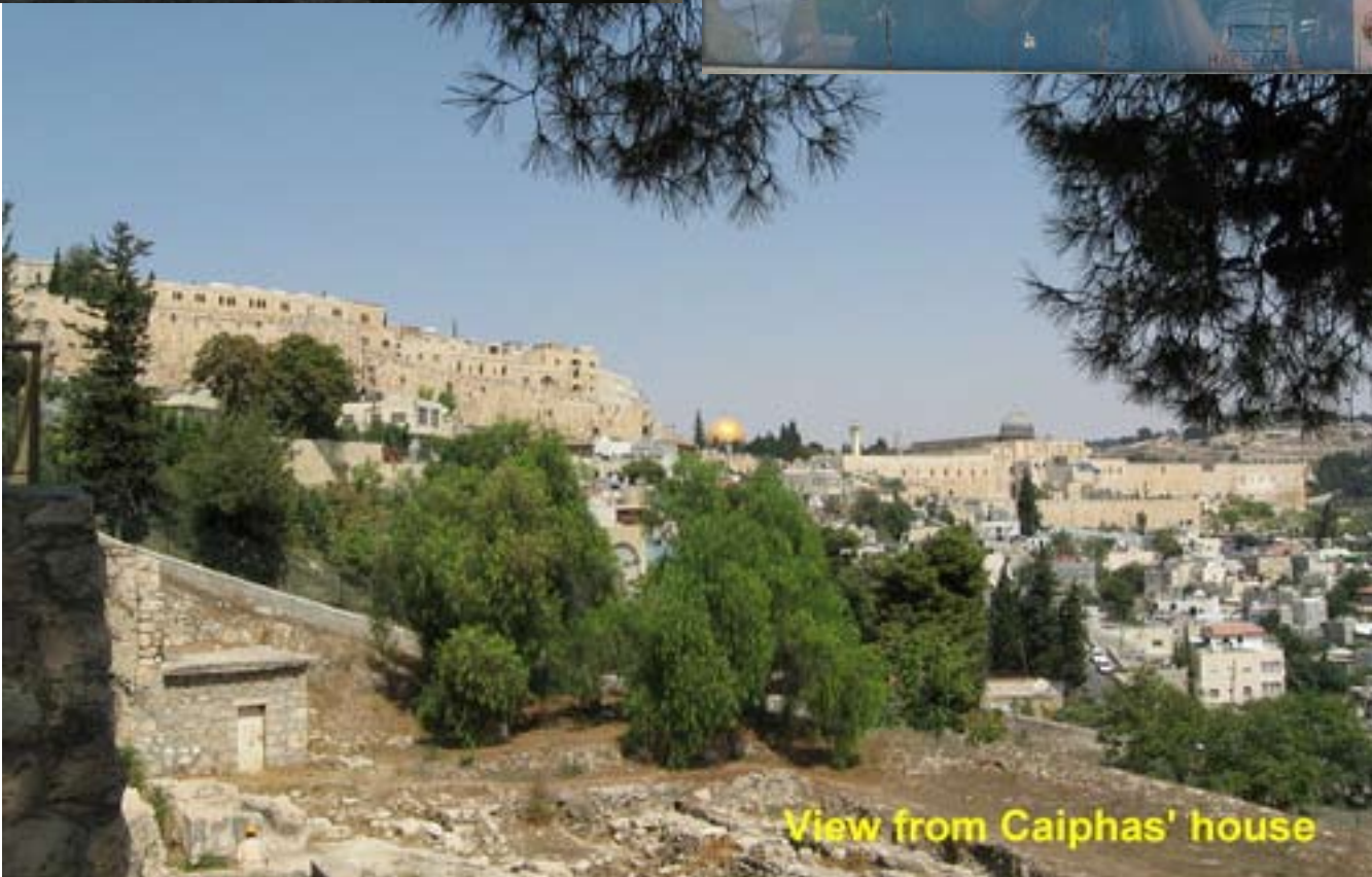
View from Caiphas' house