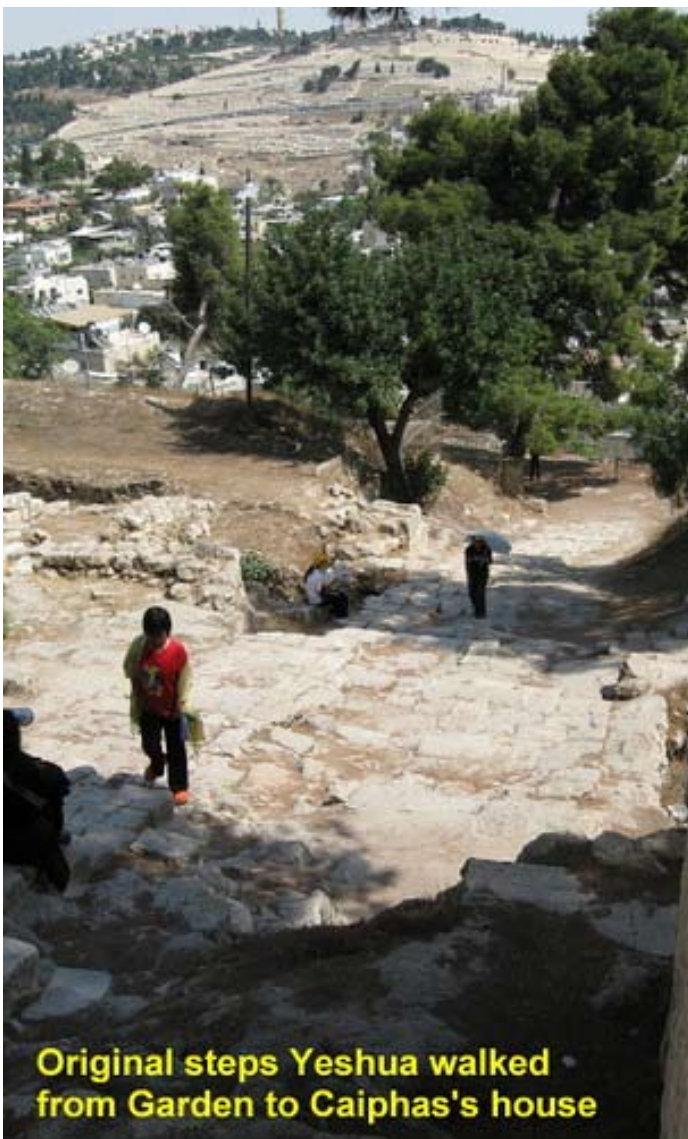
Original steps Yeshua walked from Garden to Caiphas's house